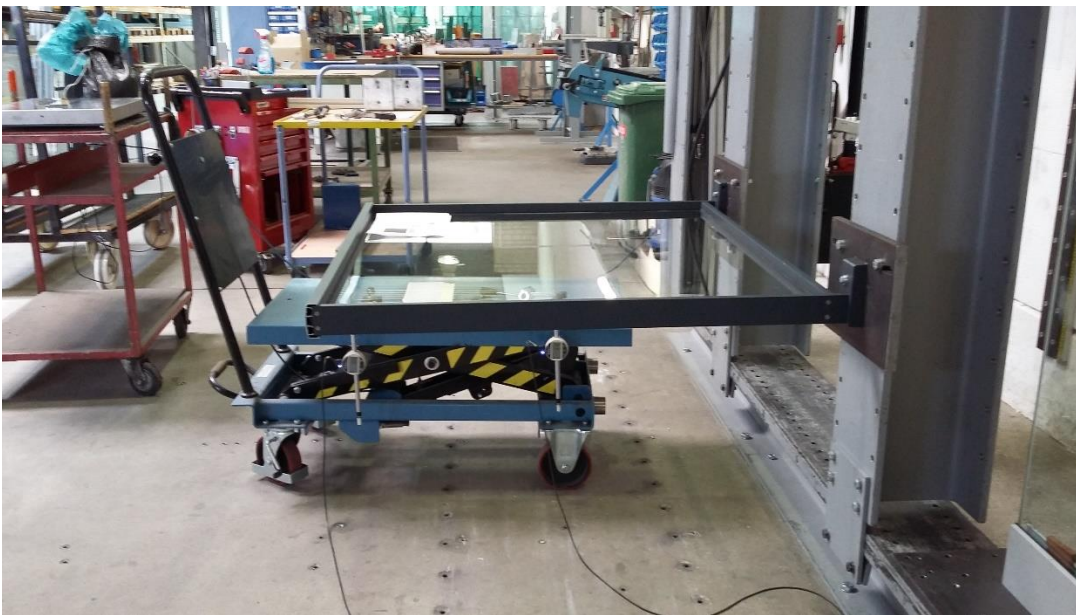
Option A Typical arrangement for application of uniformly distributed load applied to the barrier system

The deflection measurements at the centre of the glass and at the handrail were taken from fixed datum points using a calibrated digital indicators.